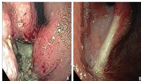
FIGURE 2 - Group 2: A) Esophagogastroduodenoscopy pre-neoadjuvant chemotherapy showing Borrmann classification-III ulcerated lesion located at