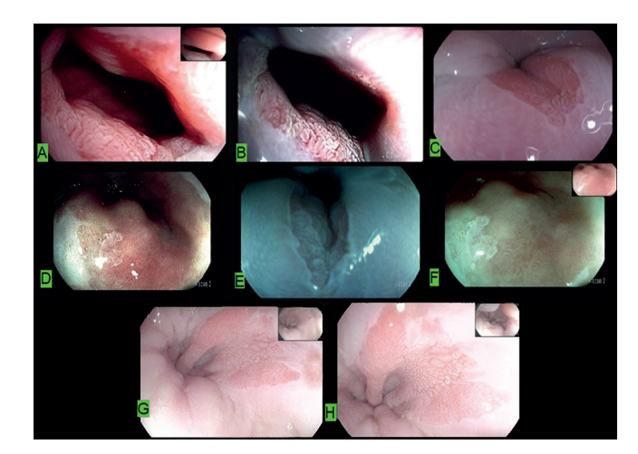
FIGURE 1 - Areas of distal esophageal columnar epithelialization delimited with acetic acid and digital chromoscopy: A) magnified with acetic acid; B) magnified with digital chromoscopy; C) with acetic acid; D, E and F) with different digital chromoscopies; G and H) with acetic acid.

The patients underwent videoendoscopy with highdefinition devices (Pentax i scan) using up to 2x optical zoom, digital chromoscopy and acetic acid to better identify areas of columnar epithelium and direct biopsies (Figure 1). The images obtained were recorded and saved in a database (Perseus and Endox® system, SP). At least 10 images were obtained per patient in all cases.