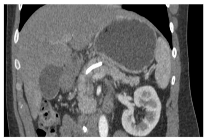
FIGURE 4 – Abdominal CT showed complete resolution of the pancreatic fluid collection

On the 30<sup>th</sup> post-drainage day, a new abdominal CT showed complete resolution of the pancreatic collection (Figure 4). The patient is currently on two months follow-up and remains asymptomatic. An ERCP is planned on the 3<sup>rd</sup> month evaluation for removal of the pancreatic stent.