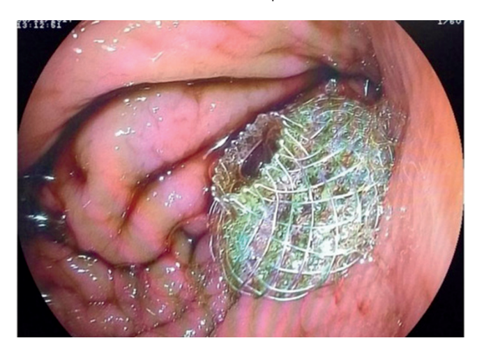
FIGURE 2 – Endoscopic drainage with a 10x10 mm HOT-AXIOS™ stent with an immediate output of a brownish secretion with necrotic solid components

anesthesia. After puncture, there was an immediate output of a brownish secretion with necrotic solid components (Figure 2). The total duration of the procedure was 20 min and the time required for drainage was 4 min. We did not use fluoroscopy and there were no immediate complications.