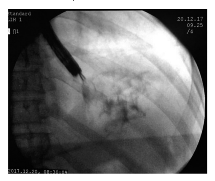
\textbf{FIGURE 3}- \textbf{Hot-AXIOS}^{\text{TM}} \, \textbf{removed using a foreign body forceps}

On the 14<sup>th</sup> post-drainage day, we performed another upper endoscopy and an ERCP for assessment of the main pancreatic duct. Firstly, we tried to introduce a typical gastroscope through the stent but it was not possible due to the complete collapse of the prosthesis. Then, we instilled contrast through the stent and we notice complete reflux back to the gastric chamber, confirming the complete collapse of the collection. Pancreatography revealed a stricture in the transition of the head and neck but no fistula. We performed a pancreatic sphincterotomy and placed a 7Fx10 cm straight plastic stent through the stricture. After deployment of the pancreatic stent, we removed the Hot-AXIOS using a foreign body forceps (Figure 3). The patient was asymptomatic and was discharged 24 h after the ERCP procedure.