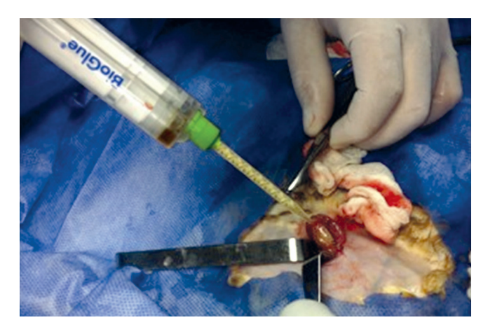
FIGURE 1 - The procedure of making and suturing the graft and application of the Bioglue support is shown

All late (second) procedures were performed without complications; mean surgical time during the 1<sup>st</sup> operation was 20.1 min and 59 min during the 2<sup>nd</sup>, with a mean time for obtaining and repairing of the peritoneal graft of 18.6\pm2.5 min (range: 15-20 min). Animals tolerated well the procedure (Figure 1) and there were no immediate postoperative complications.