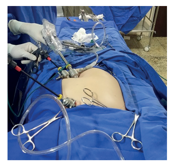
FIGURE 4 – Setup with two trocars in the umbilicus, allowing the surgeon's left hand to hold the gallbladder wall