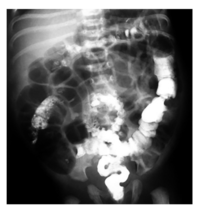
FIGURE 2 - Abdominal distention and irregular contraction

Rectosigmoid index is obtained by dividing the widest diameter of the rectum by the widest diameter of the sigmoid loop when the colon is fully distended by the contrast medium<sup>5,16</sup>. The normal rectosigmoid index is \geq 1 . In standard length HD the recosigmoid index is \leq 1 .