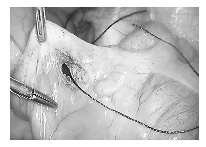
FIGURE 2 - Transfixing orifice near appendix base

The appendix was identified and mobilized to make possible to dissect its mesentery in appendicular base, creating small transfixing orifice in mesoappendix (Figure 2). Through this orifice were passed two cotton stitches 2-0 and performed double endosuture ligation of appendicular base, one proximal and another distal (Figure 3).