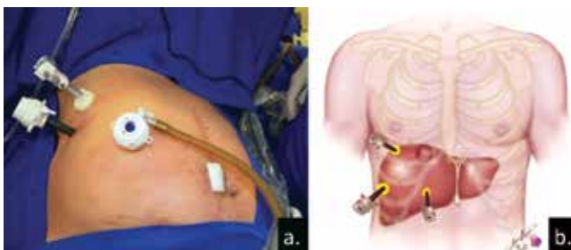
FIGURE 2 - Port placement: a) one 10 mm trocar at 2 cm under the right costal cage on the anterior axillary line; one 12 mm on the middle axillary line on the 11th intercostal space; one 10 mm on the anterior axillary line at the 9th intercostal space; b) drawing showing the correspondent interior position of the trocars

Intraoperative ultrasound is necessary to confirmed the location of the nodule and margins are delineated with monopolar cautery (Figure 3a). A 10 mm 30° optic is used and pnemoperitoneum is set under 12 mmHg pressure. Parenchymal transection is carried out employing a bipolar sealing device (LigaSure 5mm BluntTip™, Covidien, Boulder, CO, USA) (Figures 3b and 3c). The raw surface was covered with an absorbable hemostatic tissue (Surgicell Fibrilar™, Ethicon, Sommerville, NJ). Surgical specimen (Figure 3d) is extracted on a plastic bag through the 10 mm port under the right costal cage. The diaphragm is closed with absorbable 2-0 poliglactine sutures and no drains were left in the abdominal or thoracic cavity.