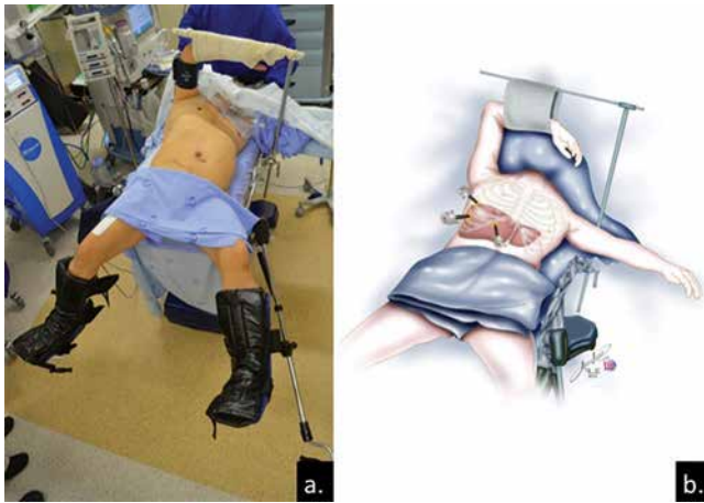
FIGURE 1 - Patient position: a) semi-left lateral decubitus; b) position of the trocars showing the access to the hepatic dome